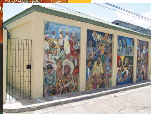
Jamaica Music Museum