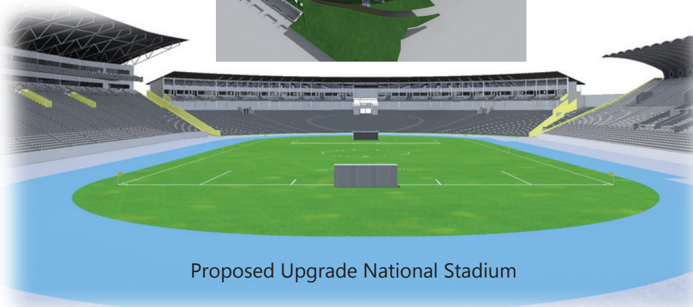
Proposed Upgrade National Stadium