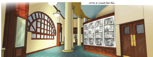
Ward Theatre Renovation