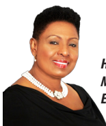
Honourable Olivia Grange, CD, MP Minister of Culture, Gender, Entertainment and Sport